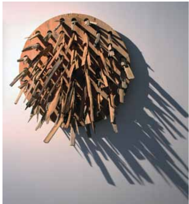
Colby Claycomb Soft Kiss of Sunrise , 2014