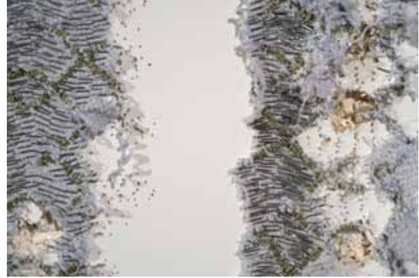
Elana Herzog Untitled (Chainlink Drapery Study) , 2004 (detail)

Like Milano, Armita Raafat's physical gestures intersect with the mathematical. Her work tears through the traditional dictates of muqarnas , an Islamic architectural ornamentation dating to the 10th century. Conventional muqarnas practice prescribes layering small niches into tiers based upon a repetitive geometric formula. Raafat's process begins in this