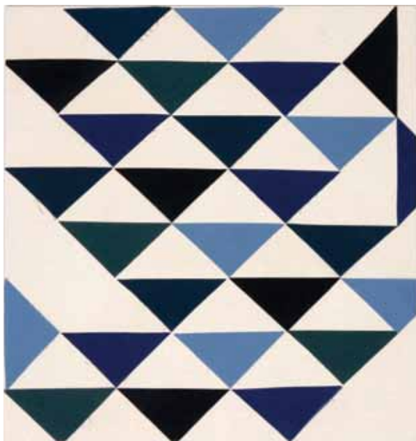
Michael Milano Triangles , 2014

The undulating ribbons of solder in Gregory's composition act as vestiges of material for viewers to somatically digest; they highlight the manual relation-