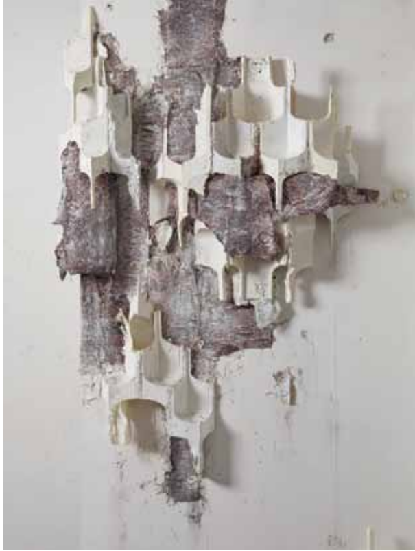
Armita Raafat Untitled , 2012 (detail)

ship between artist and material shared by all work in the exhibition. In the case of Michael Milano , the artist's physical gestures can be found in the edges of fabric he leaves unfinished while investigating quilt-making practices. Quilting is the sewing together of three layers of fabric—backing (usually a plain piece of cotton cloth), batting (a cushy layer of padding), and top (a design of pieced fabrics). Milano isolates individual steps in this process to explore mathematical and visual permutations of pattern in a non-functional context. Triangles (2014) is limited to the processes of cutwork and piecing—the arrangement of ironed and cut pieces of fabric (a sewing needle never pierces the composition). Verticals (2014) focuses on sewing, and Pleats (2015) employs folding, ironing, and sewing. None of the works include batting. Simply by looking at the traces of thread left by Milano's hand, we are ushered into the intimate space between artist, material, and process.