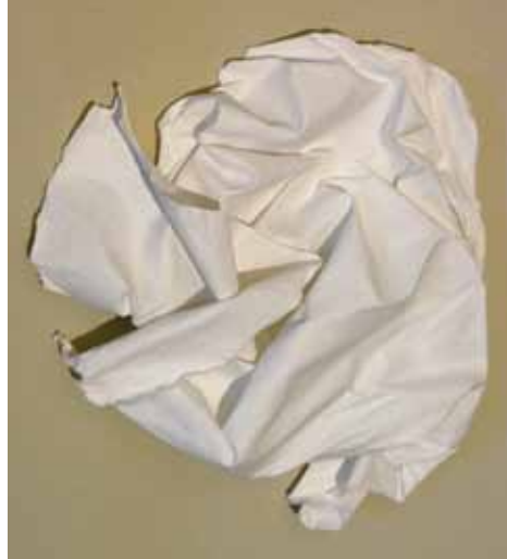
Alyssa Casey Let go (per teresa a roma) , 2012

Cheryl Ann Thomas works with clay as well, and is equally fascinated with its material makeup and relationship to weight and gravity. For Thomas, however, form follows failure. Using porcelain, Thomas layers thin rope like strands into 5-foot columns, halting her hands-on manipulation once firing begins in the kiln. It is during firing that the porcelain asserts its materiality, collapsing into folds and bulges to catch its own weight under the force of gravity. Evidence of this can be traced in the sinking walls of Violet (2014), or the crumpled orifices